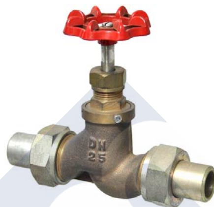
FIG. 210 Racores